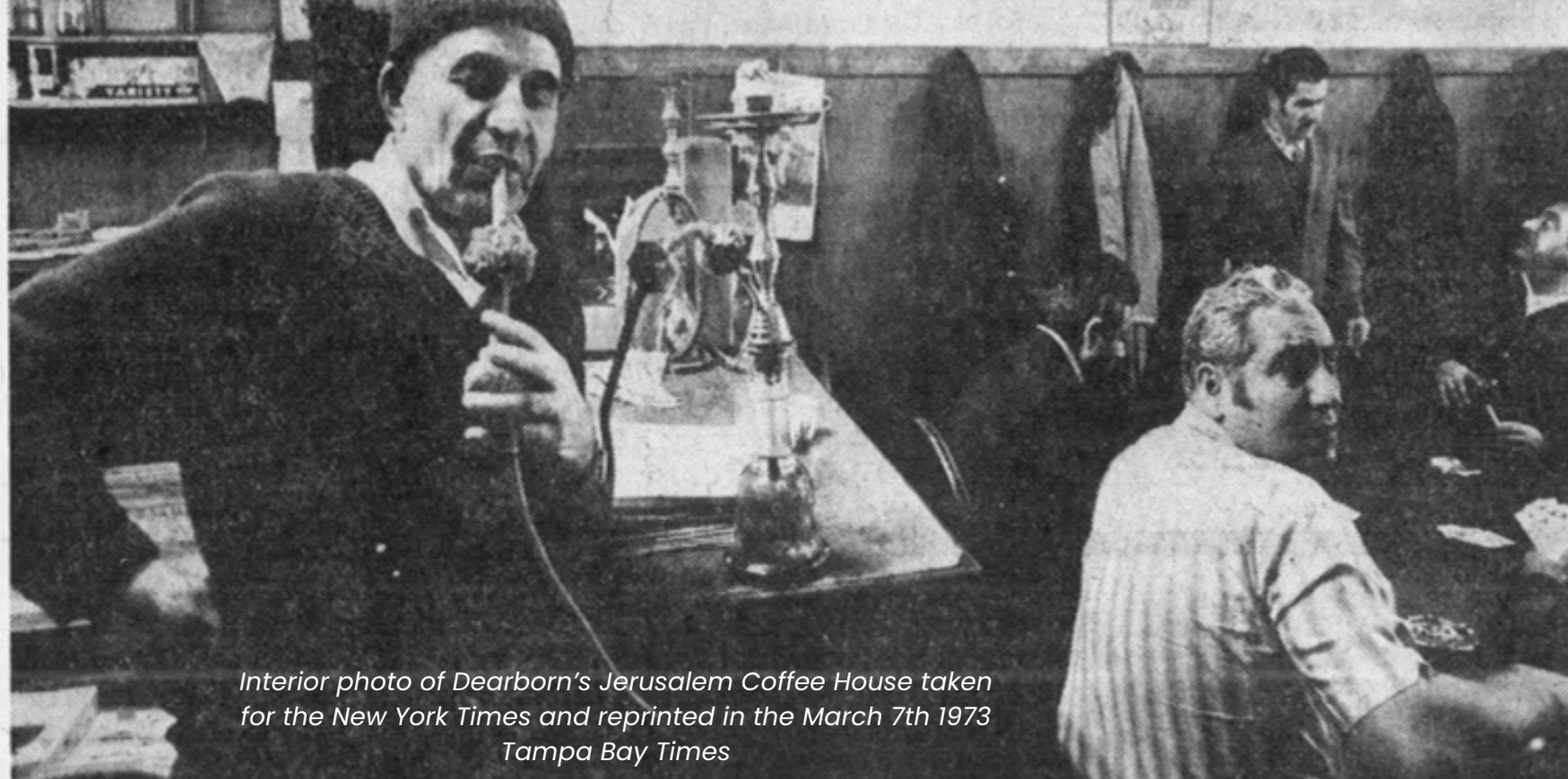
Interior photo of Dearborn's Jerusalem Coffee House taken for the New York Times and reprinted in the March 7th 1973 Tampa Bay Times

Historically, coffeehouses have always served as "third places".