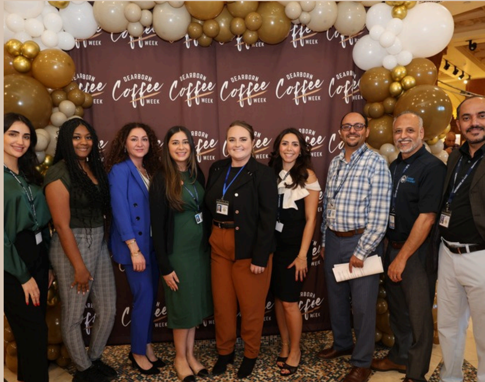
The Economic Development Workforce & Business Services Team organizes this annual event