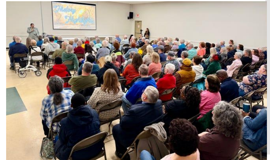
Southside History Lecture Series