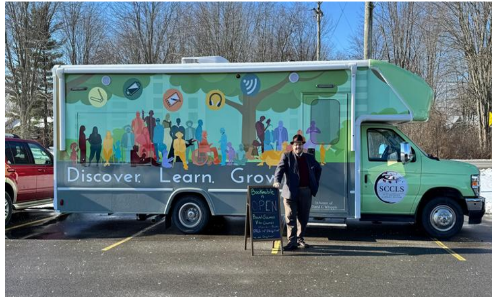
St. Clair County Library System