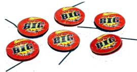
Ball & Disk