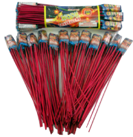
Bottle Rockets/ Sky Rockets