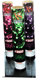
Single Tube Device with Report