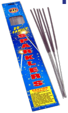
Sparklers & Sparkler Trees