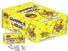
Snappers/ Drop Pops