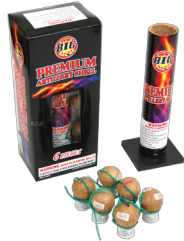
Reloadable Shell Device